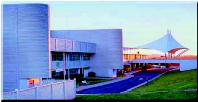
Port Macquarie Hospital

Port Macquarie Base Hospital serves a population of 112,000 located in an idyllic coastal and riverside township. The staff foster long term relationships with trainees and a large number return to work in the region. Port Macquarie has the highest percentage of registrar returns for second terms compared to other rural hospitals. The UNSW has an established rural medical school at Port Macquarie for medical students.